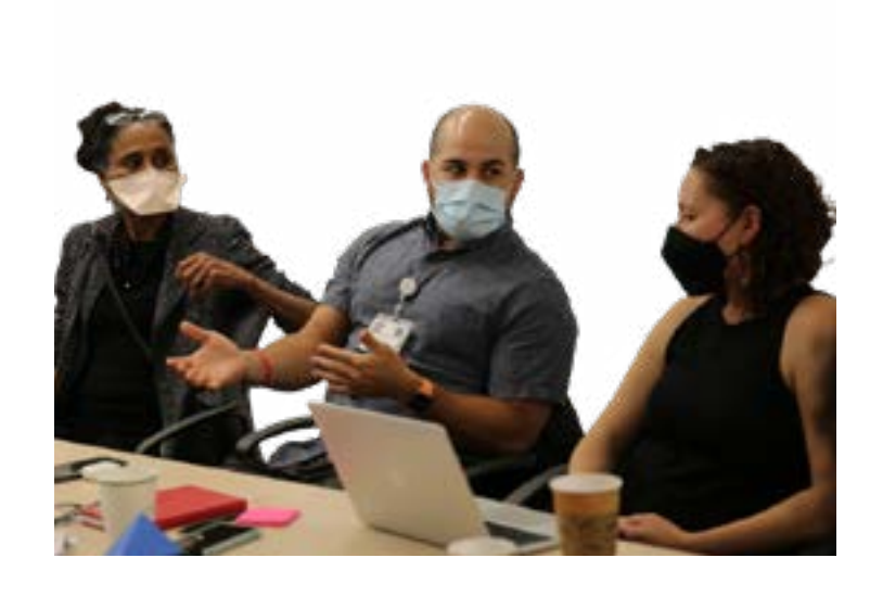
OCTOBER 2022 AOCI Team Retreat 2022

AOCI joins Quarterly All Student Forum to update on Anti-Oppression Initiatives